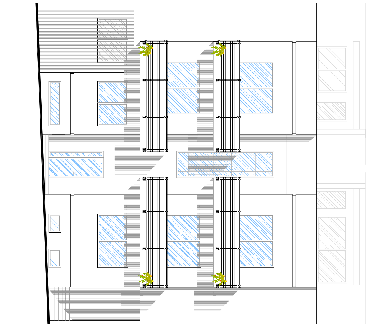
Proposed front elevation scale 1:100

NOTE : FACADES ARE TO BE FINISHED RENDERED IN COLOURED GRAFFIATO AS SHOWN. : BALCONY RAILINGS ARE TO BE IN POLISHED GREY ALUMINIUM BALUSTERS & HANDRAIL : ALL APERTURES ARE TO BE IN GREY ALUMINIUM